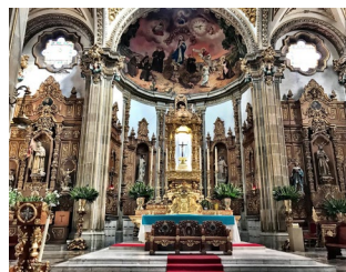
Church of San Juan Bautista