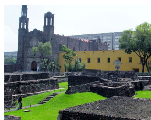
Plaza of the 3 Cultures