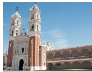
Our Lady of Ocotlán

intricate stone carvings and historical significance in the evangelization of Mexico. Tonight, dinner and overnight accommodations in Mexico City.