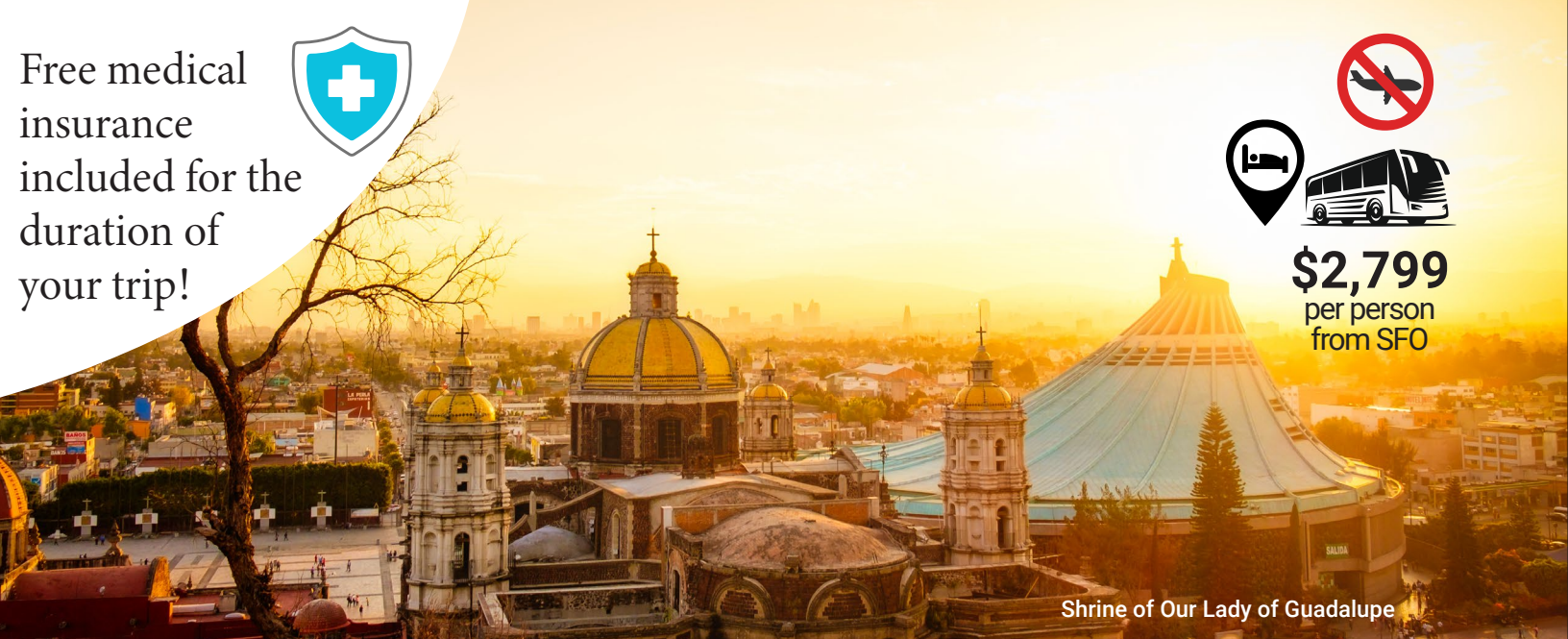
Shrine of Our Lady of Guadalupe